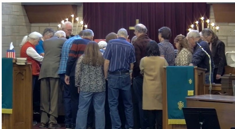
Congregation Praying Over Shoeboxes

May God bless those who gave ... ... and may God bless those who will receive.